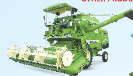
MALKIT 997 Deluxe Self Propelled Combine Harvester