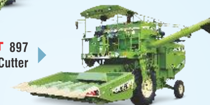
MALKIT 897 with Maize Cutter