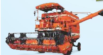
MALKIT 897 Axial Flow