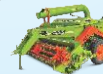
MALKIT Straw Reaper