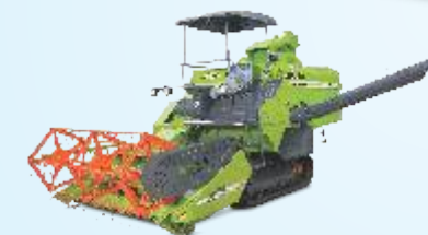
MALKIT 597 Partner Axial Flow Track Combine Harvester